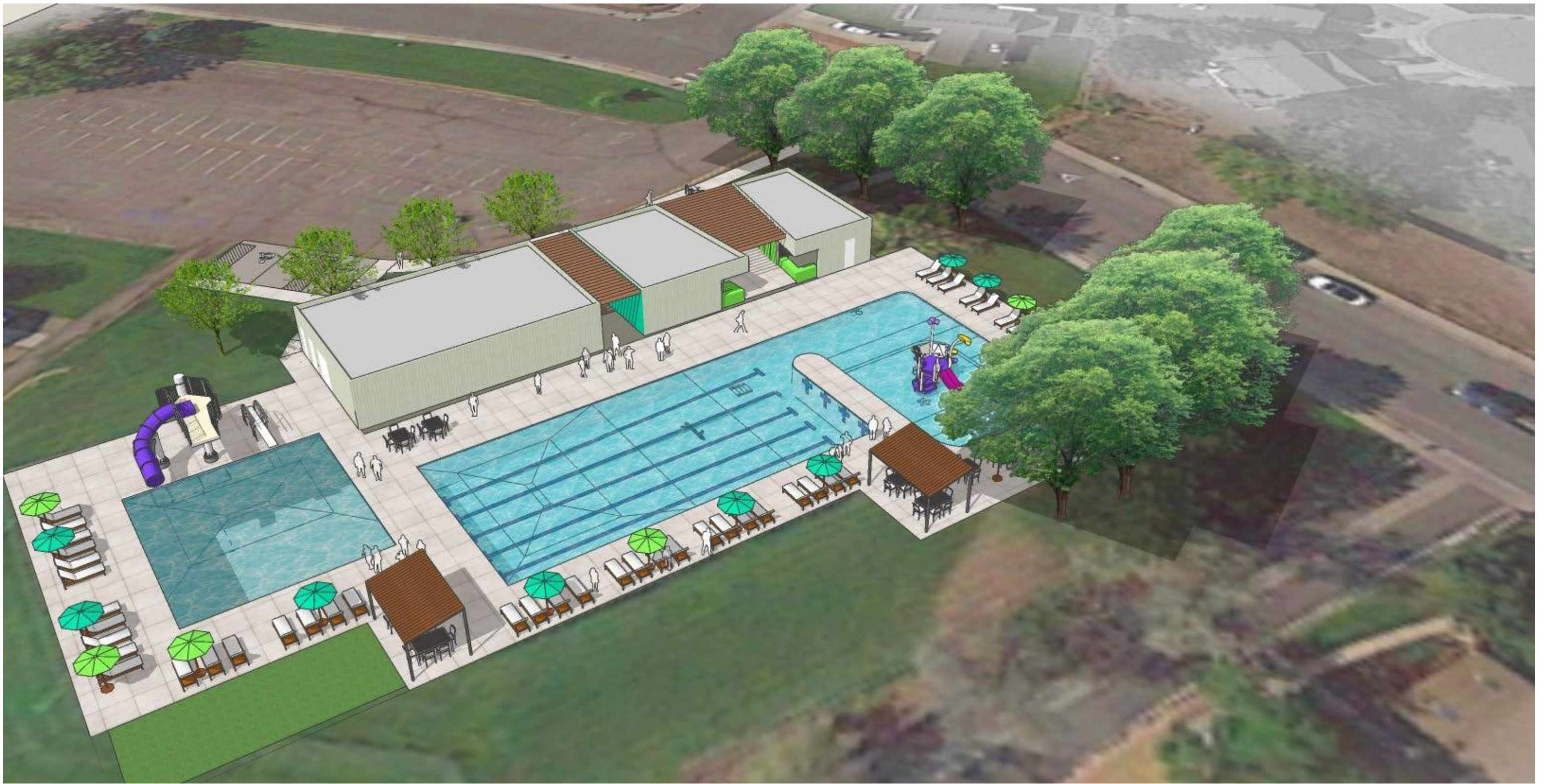
View Looking Southwest